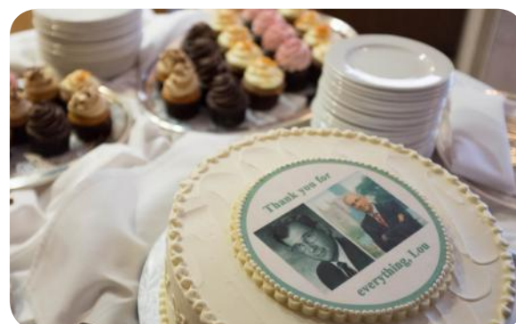
All things sweet at the Chair's farewell party.