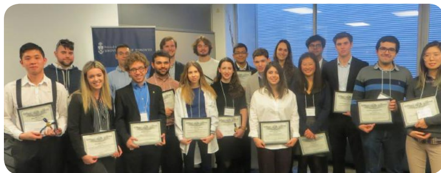
Recipients of undergraduate awards at this year's celebration.